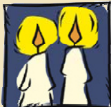
Lighting the Candles for Shabbat:

First light the candles. Then spread your hands out around the candles drawing your hands inward in a circular motion three times to indicate the acceptance of the sanctity of Shabbat.